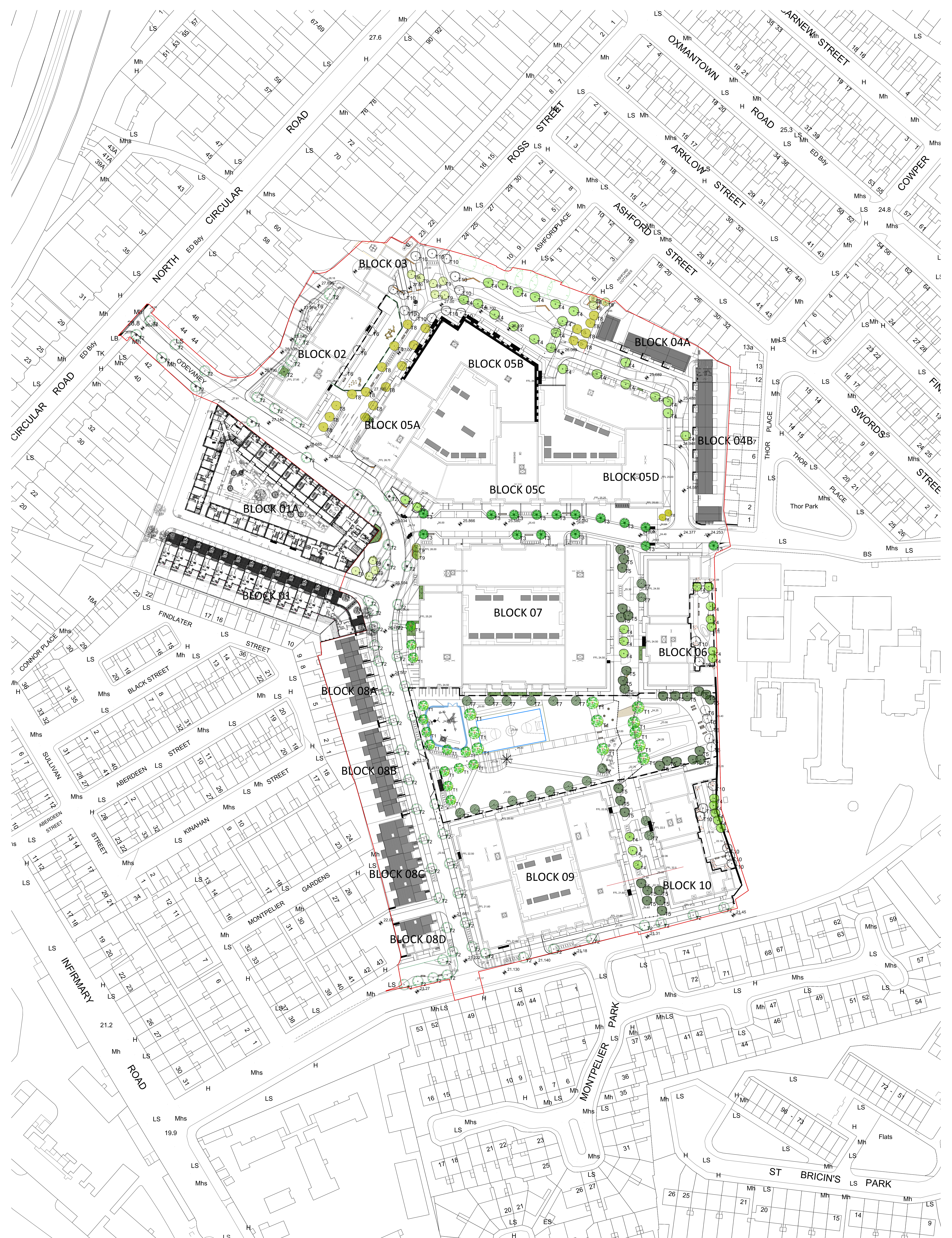
Site Plan - Proposed Ground Floor